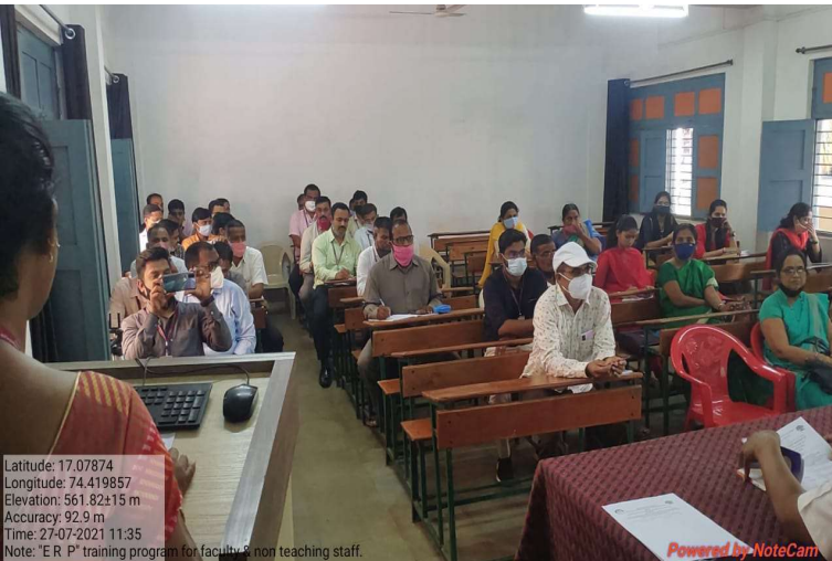
Teaching faculty and Non-Teaching faculty participated in ERP training programme.